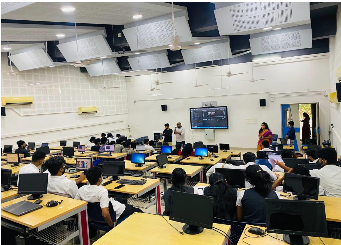
The attendees for ETHICAL HACKING