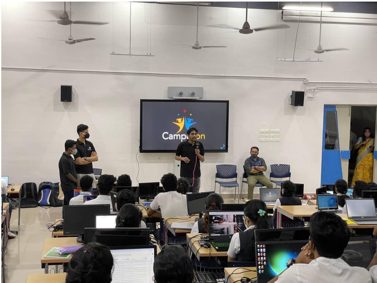
Campuzon Technical Representatives