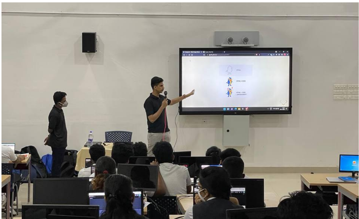
The class on Web development