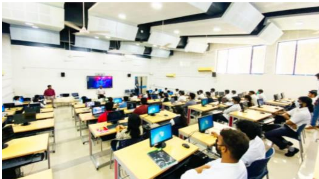
Attendees of the event